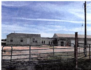
New location, Burlingame South, was purchased Spring 2016.